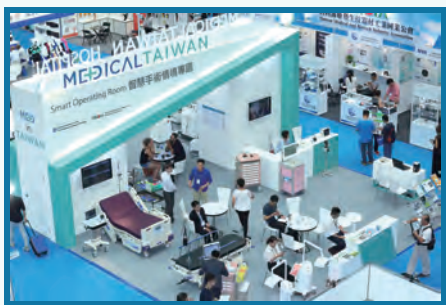
Smart Medical Scenario Pavilion