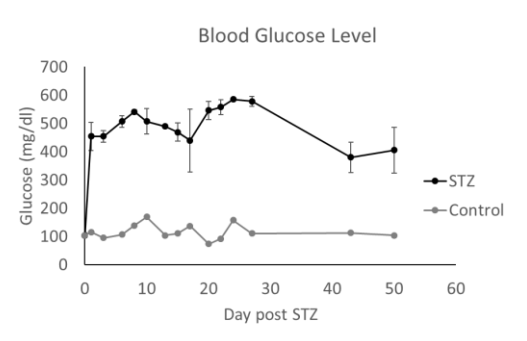
Figure 1 . STZ injection induces diabetes in nude rats. Nude rats (n=1 control; n=3 STZ) were injected with 60 mg/kg STZ IV on day 0. Blood glucose of STZ-treated rats rose to over 350 mg/dl and remained at this level for the duration of the 50-day study. Normal rat remained approximately constant in blood glucose level. Mean +/- standard error is shown for STZ treated rats.

STZ injection resulted in elevated blood glucose to levels of 400-500 mg/dl, over 2-3 times the normal level (normal approximately 100-150 mg/dl) ( Figure 1 ). This was maintained for the entire duration of the 50-day study. There was a slight decrease in blood glucose by day 43, though still over twice the normal level. The loss of the ability of the pancreatic beta cells to produce insulin in diabetic rats was confirmed by ELISA ( Figure 2 ).