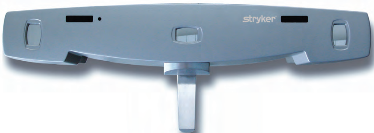
Stryker Navigation Camera

Each operation plan is coordinated individually, taking the patient's and the medical team's needs in the OR into consideration.