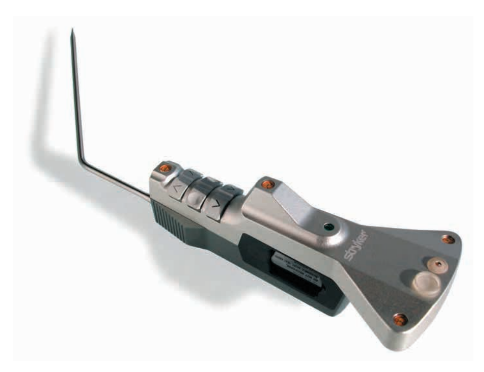
Ergonomics as a quality principle: hand-operated, cordless surgical tool for navigated, minimally invasive intervention